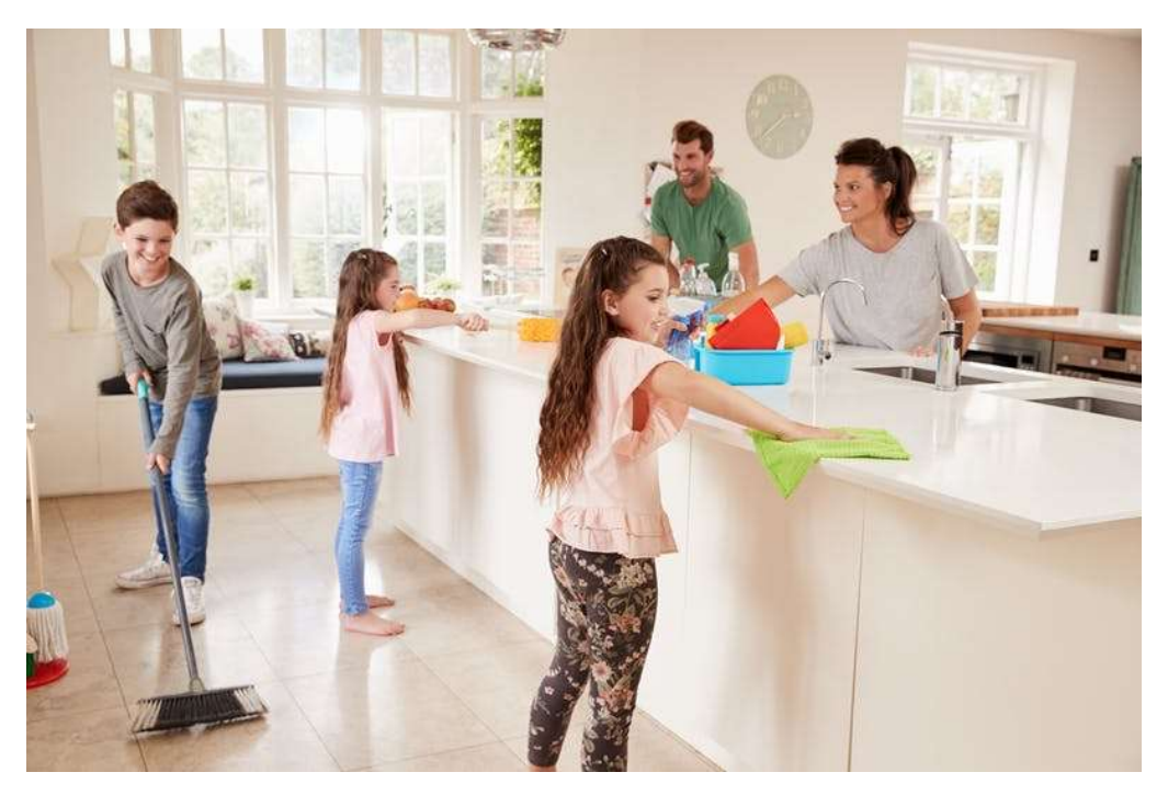
Picture1: Hygienic environment

Unhygienic environment is the source of different germs of the diseases. Cutting or chopping food, cooking and having food in unhygienic condition carries several germs which infects the food as well. When this food is taken the body becomes sick.